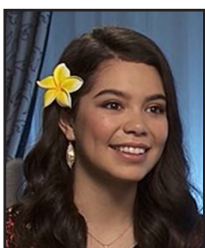
Chloe Auli'i Cravalho