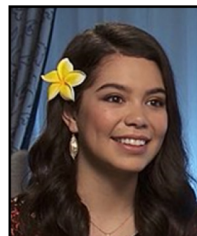
Chloe Auli'i Cravalho